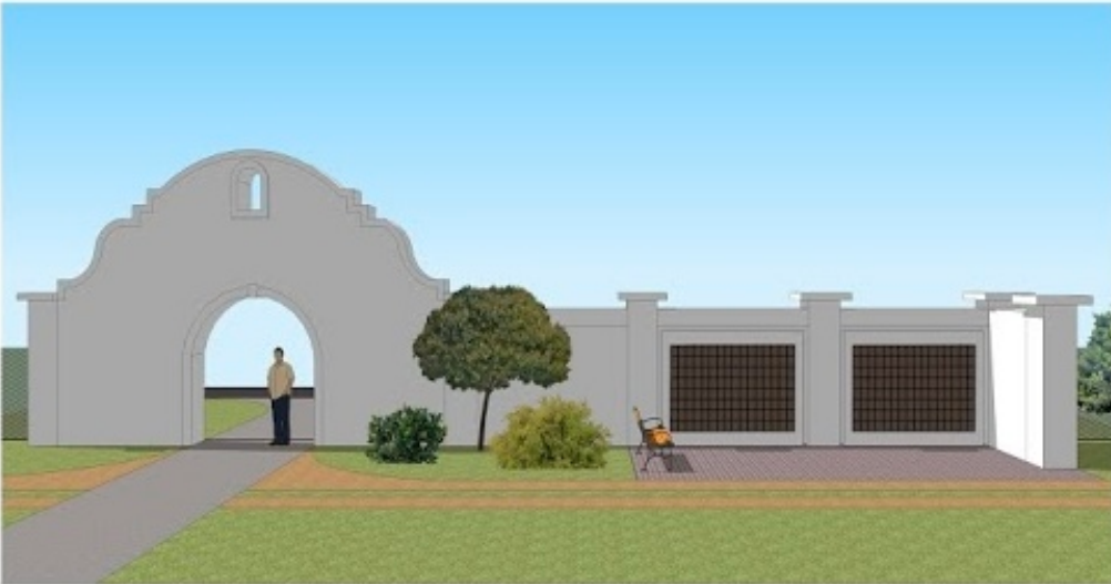
R e a r E l e v a t i o n

Last year, the organization applied for a different grant and was unsuccessful. Results ought to be promulgated in October.