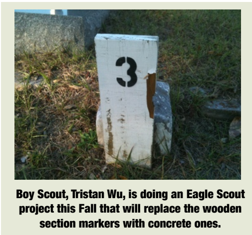
Boy Scout, Tristan Wu, is doing an Eagle Scout project this Fall that will replace the wooden section markers with concrete ones.

The results have been great. Fewer people "joy ride" through the cemetery, and folks drive slower. Also, the Corporation moved the dumpster outside the cemetery so there are no garbage trucks tearing up the roads now. THANKS AGAIN, DONORS!