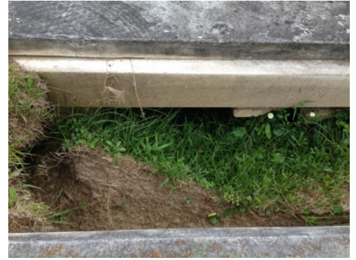
Right: During the deluge of April 29-30, a few vaults were compromised. All these had been built by bricks, and the mortar had given way. Gulf Coast Wilbert, which is the undertaker company assigned to SJC, fixed the problems.